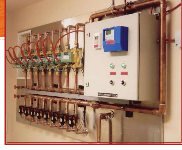
BEHIND THE SCENES > Pumps, valves and controls for the individual room zones in the home.

As GSHP's become more common place, contractor's costs will continue to drop and apprehension about dealing with an unknown product will also diminish. Check with your local utility company to see if loop field installation incentives exist in your area. There are many grants and rebates already in existence in many counties around the United States.