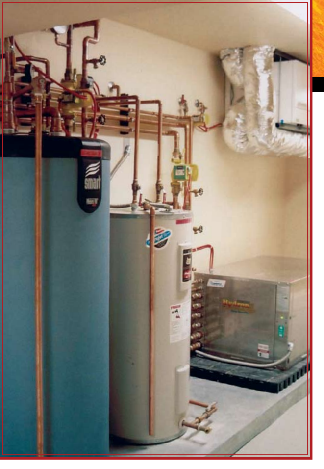
BUFFER TANKS > Pump with the storage tanks for domestic hot water and hydronic hot water.